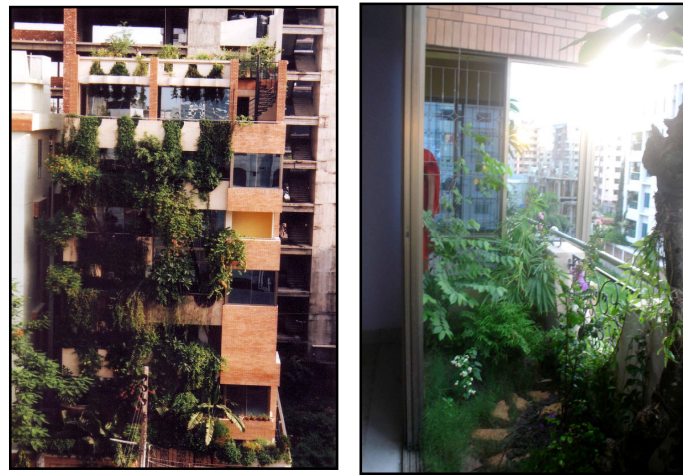
Figure 1: Green application on Building in dense Dhaka city

Green attachment of residents with green verandah in building is participation of urban residents with physical and leisure activities. The quality of physical properties and attributes of the green landscapes including diversity of spaces, and enriches the experiences of users. Studies of place attachment have also focused on people's use of particular places for self and emotion regulation (Korpela and Hartig, 1996). Residents perceive the green space as their favorite place that affords residents relaxation and relief from mental stress. Green rooftop and green verandah is a place for them to perform physical activity with privacy, safety and security. This is a favorite place, which appears to afford restorative experiences that aid emotion- and self-regulation processes. For example, studies indicated that favorite place is visited to relax, calm down and clear minds (Korpela, 1992).